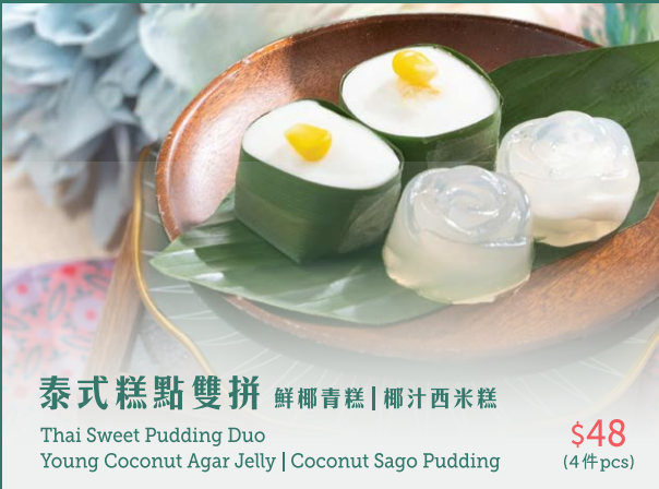
泰式糕點雙拼 鮮椰青糕 | 椰汁西米糕

Thai Sweet Pudding Duo Young Coconut Agar Jelly | Coconut Sago Pudding