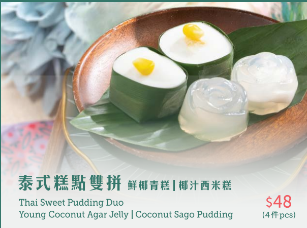
泰式糕點雙拼 鮮椰青糕 | 椰汁西米糕

Thai Sweet Pudding Duo Young Coconut Agar Jelly | Coconut Sago Pudding